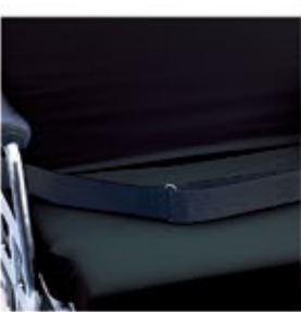
LAP BELT included