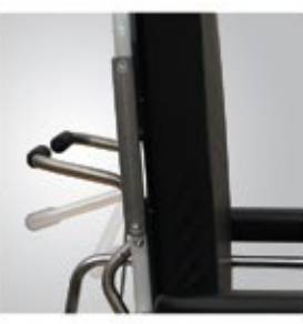
transport, also fold down for radiology procedures