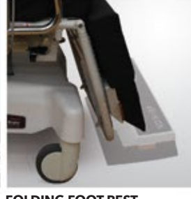
PUSH HANDLES for easy patient FOLDING FOOT REST