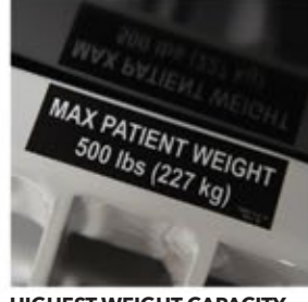
HIGHEST WEIGHT CAPACITY patient ingress and egress 20 in. 500 lbs