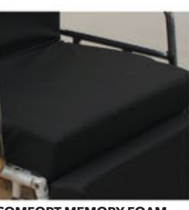
CUSHIONS and soft medical grade stretch fabric for an exceptional patient experience.