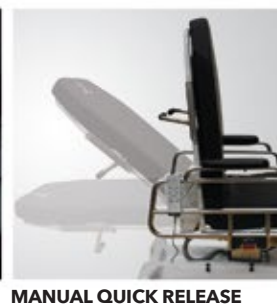
BACK with 0° to 86° positioning